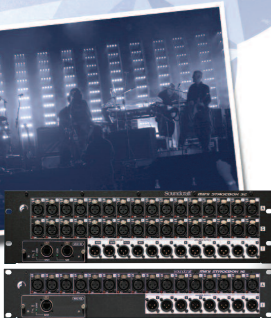
The 3U Mini Stagebox 32 and 2U Mini Stagebox 16 come with interface cards included.