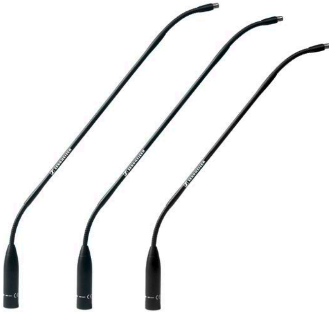
MZH 3072 MZH 3062 MZH 3042

The MZH 3042, MZH 3062 and MZH 3072 are metal goosenecks with two flexible sections for use with the ME 34, ME 35 and ME 36 microphone capsules. The rugged, matte black goosenecks are fitted with a balanced, floating XLR-3 output, enabling the microphone to be powered from 12 – 48 V phantom power.