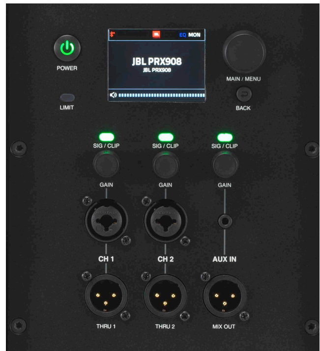
REAR PANEL CONNECTIONS

The JBL PRX908 , part of the PRX900 Series of powered loudspeakers and subwoofers, takes professional portable PA performance to a new level with advanced acoustics, comprehensive DSP, unrivaled power performance and durability, and complete BLE control via the JBL Pro Connect app.