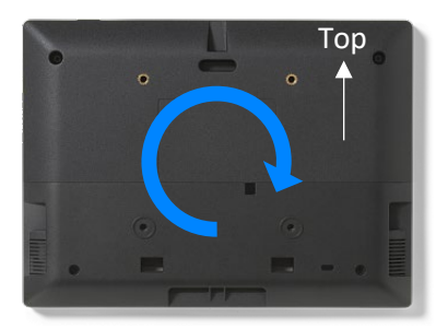
FIG. 2 Varia Touch Panel, rear

1. Place the panel face-down on a soft cloth and arrange the panel so that the top of the touch panel is closest to you.