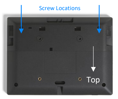
FIG. 3 Rear cover screws, if installed

2. If they are installed, remove two small screws from the lower cover.