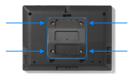
FIG. 6 Mounting Plate Installation

NOTE: The three slots should be oriented UP and the set screw holes should be oriented DOWN.