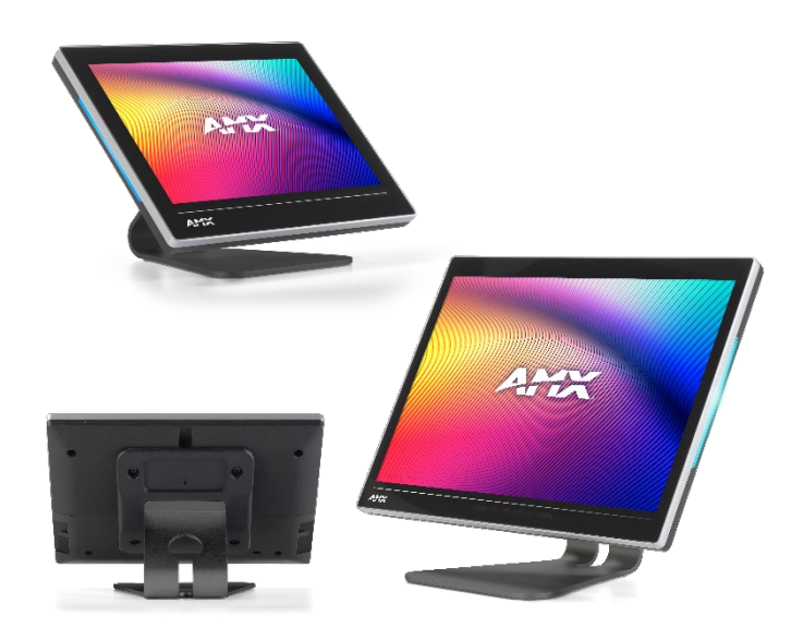
FIG. 9 Varia Touch Panels on Angle-Select Tabletop Stand, various angles